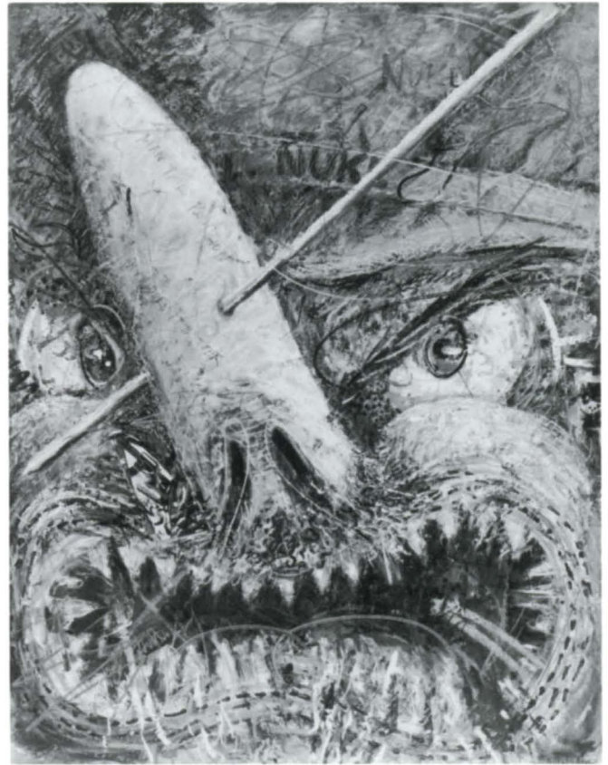
Colonel Nuke Pricked , 1984, oil stick, acrylic and collage on paper, 53" x 42", courtesy private collection, New York.

When I talked with Arneson shortly before his death, he commented that he was at long last almost cured of Jackson Pollock – a comment I took to refer to the grandiosity of Pollock's romantic ego that has affected so much post-World War II art. Considering Pollock as the equivalent of a disease is far different than regarding him as a soul mate, as many writers on Arneson have done. If one compares Pollock and Arneson, it is hard to find any parallels aside from the obvious fact that both spent their childhoods in California. One might say that Pollock was important to Arneson because of being his diametrical opposite. A member of the New York School, an alcoholic, a loner and an angst-ridden individual without a sense of humor, Pollock differed significantly from the