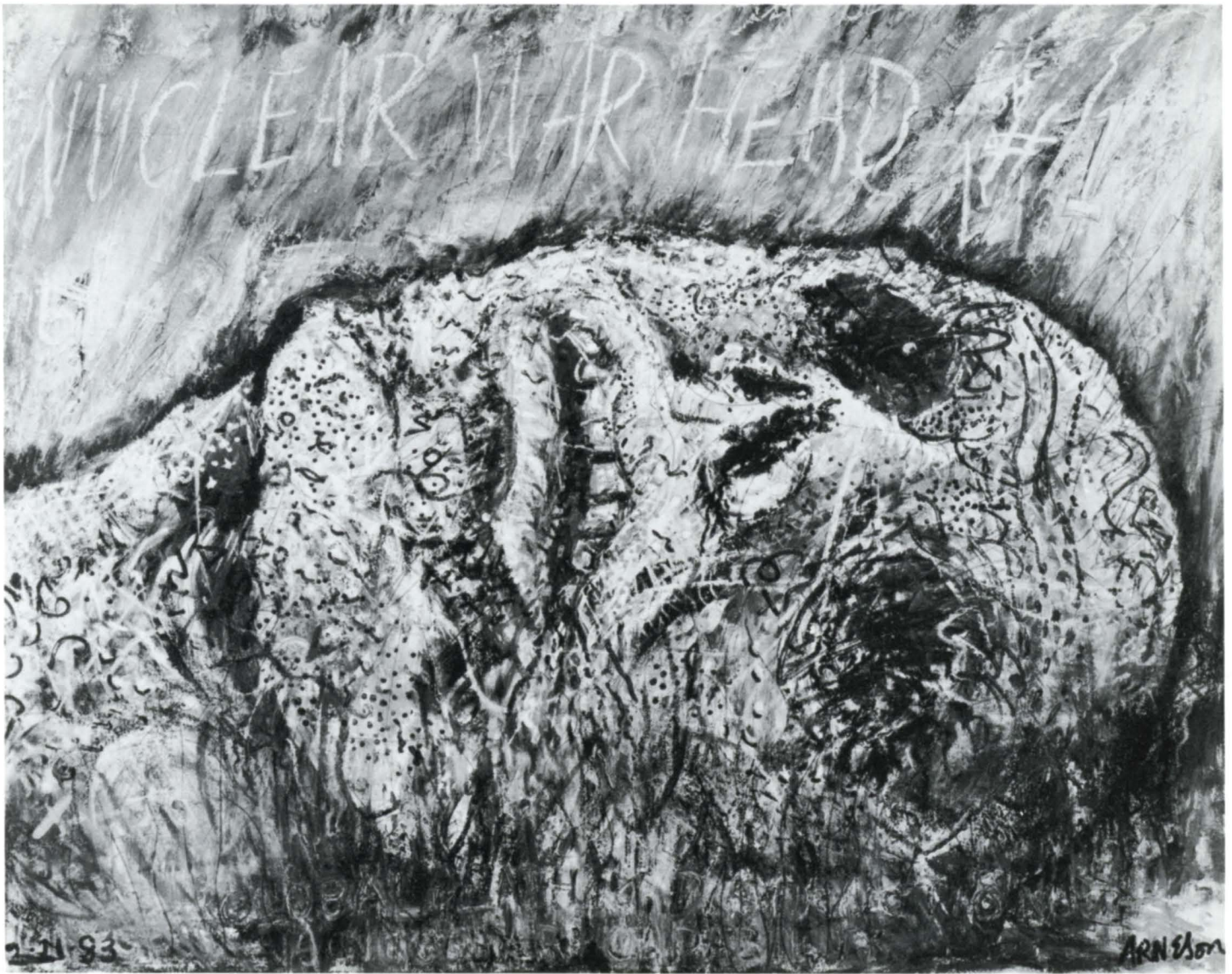
Nuclear War Head #1, 1983, acrylic and oil on paper, 44" x 55", courtesy private collection.