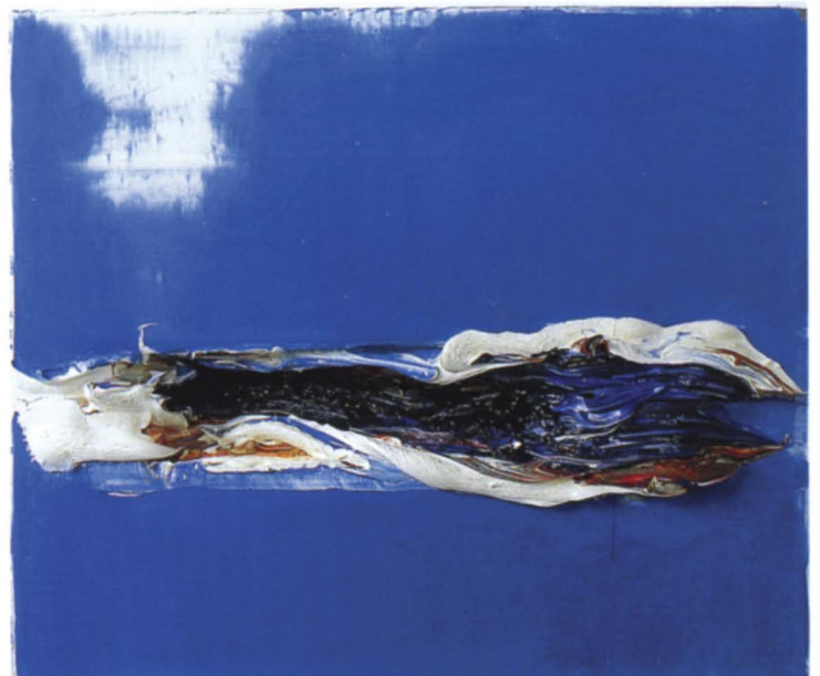
Leslie Wayne, Fumbling Forward , 1998 oil on wood, 12" x 12", JCCC permanent collection, acc. no. 99.8

Vase , 1986 burnished earthenware, 18.5" x 13" x 13" JCCC permanent collection, acc. no. 86.1