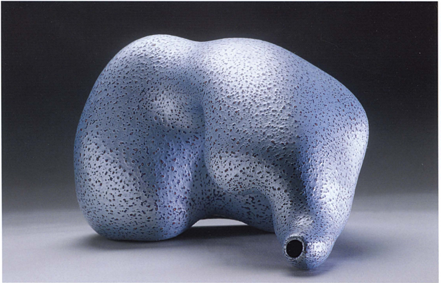
Ken Price, Half Mast , 1999, acrylic on fired ceramic, 8.5" x 15" x 11", JCCC permanent collection, acc. no. 99.5