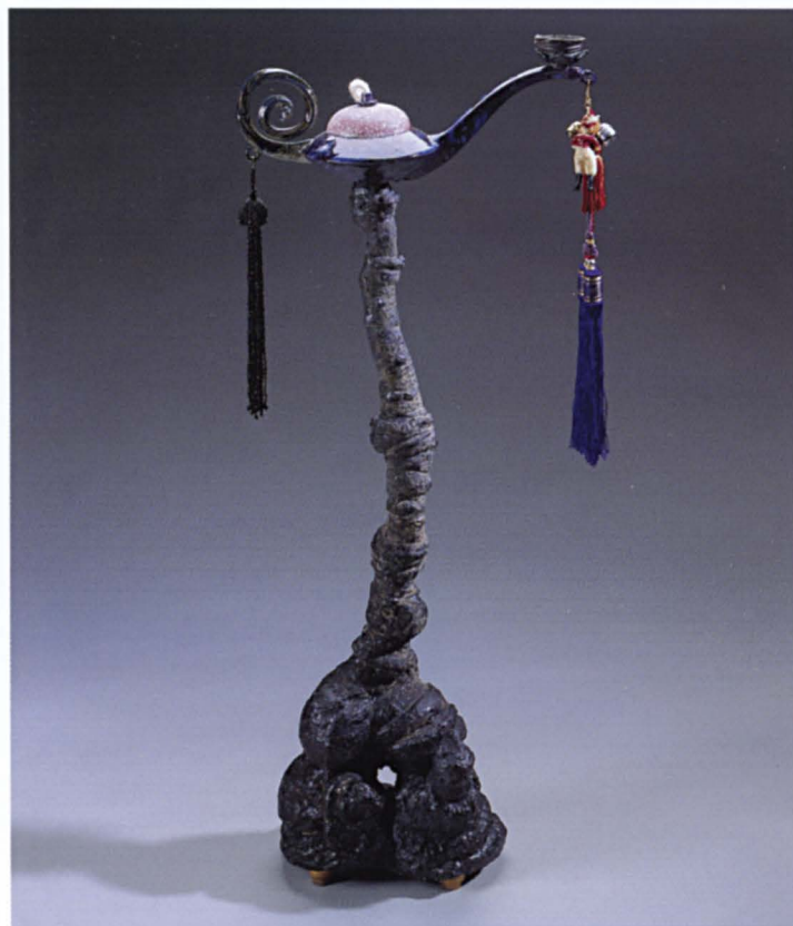
Adrian Saxe, Hi-Fibre Snowball-Seeking Magic Lamp , 1997, earthenware, stoneware, 27.75" x 12.5", JCCC permanent collection, acc. no. 98.1