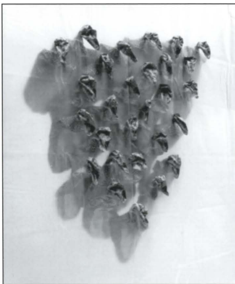
Croup , 1988, unique cibachrome photograph, 62 1/4" x 48 3/8". Private collection, Oklahoma City

Webb was a sculpture student at a progressive art school in New Zealand when he took up photography to record his own arrangements of life-cast figures of fiberglass. The medium suited his thoughtful, if slightly subversive, temperament. One of his student projects was a film, shot painstakingly frame-by-frame, of an umpire overseeing an underground, off-camera tennis match. Another was a photograph of a child in a picturesque English garden