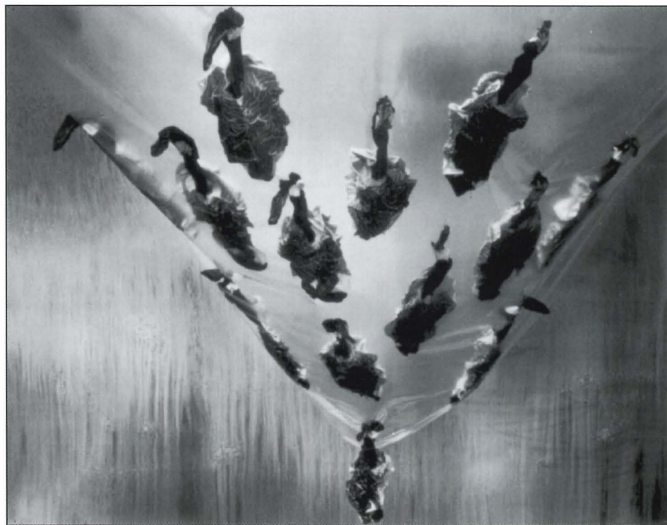
Thaw , 1989, unique cibachrome photograph, 48 3/8" x 62 1/4." Courtesy Sonnabend Gallery, New York

Cover: Undrained , 1988, unique cibachrome photograph, 48 3/8" x 62 1/4." Collection Edwin C. Cohen, New York